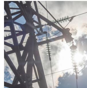
Power System Analysis