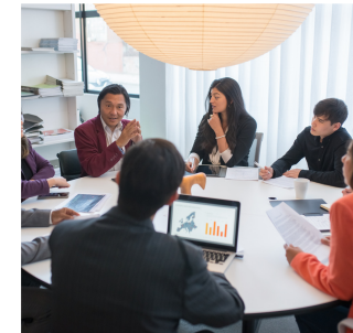
Problem Solving & Leadership Skills