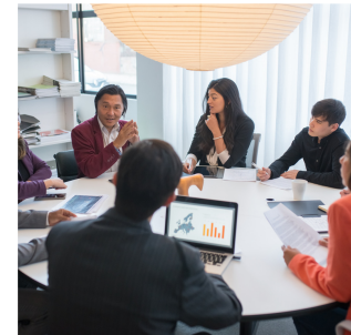
Problem Solving & Leadership Skills