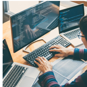
Power Systems Design Critical Infrastructure