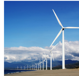
Innovating Sustainable & Renewable Power