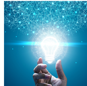
Personal Development for Chartership